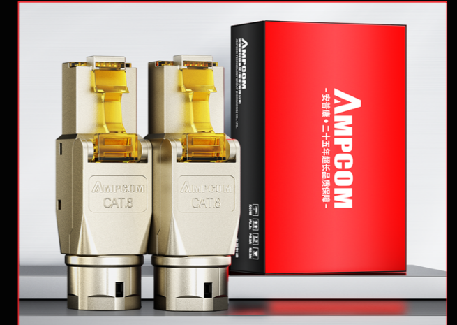
Exquisite Exclusive Vacuum Formed Packaging