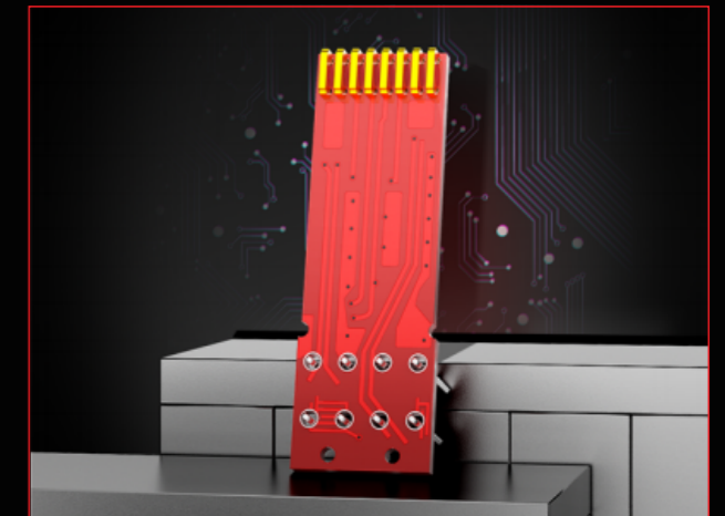
Built In Competitive Grade Customized High-speed Circuit Board