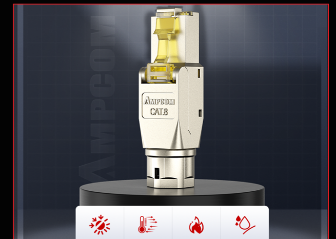
Through Various Tests Strict Quality Control Of Products