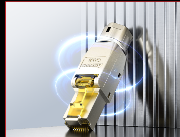
Fully Enclosed Zinc Alloy Shielded Housing For Enhanced Interference Resistance